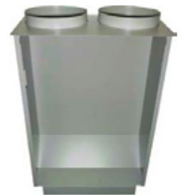
Dual inlet plenum used on the 5-ton.