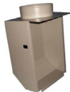
Single inlet condenser plenum used on all models except 5-ton.

2DCP ... Condenser Inlet Air Plenum allows condenser air to be ducted into the unit from outside the conditioned space if required. This also eliminates negative air pressure in the space being cooled by eliminating infiltration. 2DCP-1 fits 20AC12, uses one 12 in. duct and can handle 25 equivalent ft. 2DCP-2 fits 20AC18, 24, uses one 12 in. duct and can handle 50 equivalent ft. 2DCP-3 fits 20AC 35, uses one 12 in. duct and can handle 50 equivalent ft. 2DCP-4 fits 20AC60, uses 2 12 in. ducts and can handle 80 equivalent ft.